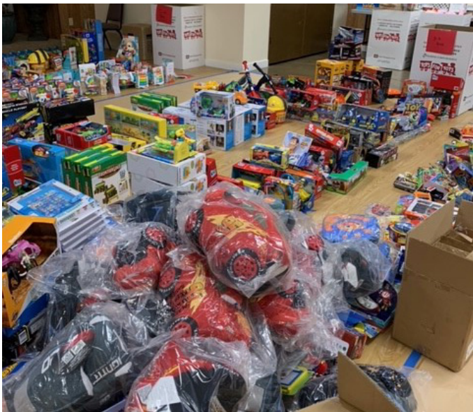
Just a few pictures of the toys that Toys for Tots were distributed this last Christmas.