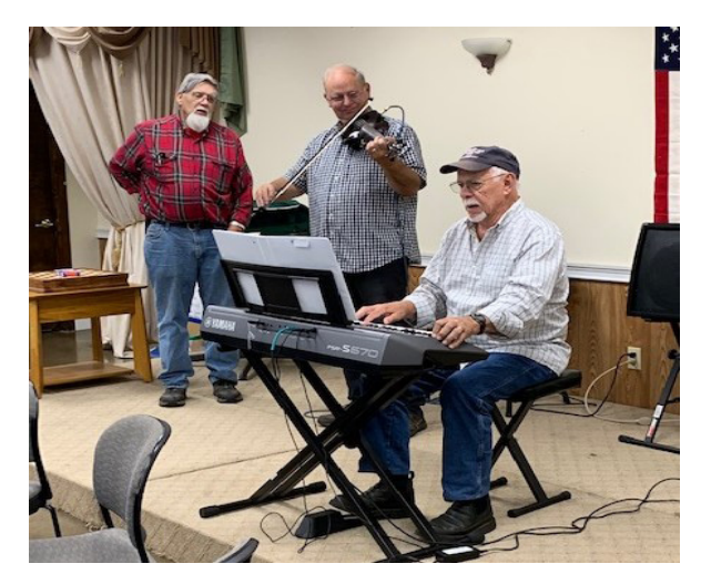
Music at the birthday gathering on July 12th. They are a crowd pleaser.

In this newsletter mailing we including our new Remittance Envelope for your convenience. Our hope is to receive enough donations to pay off our mortgage. As a nonprofit we rely on others generosity and do not receive government subsidies. We are self supporting and our largest source of income comes from Nifty Thrifty. At this point the envelopes have paid for themselves and they continue to come in. We will include the envelopes in our mailings on a quarterly basis and are grateful for the donations we've already received. Any size donation counts and they are truly appreciated. We are looking at donations as one gift at a time; they all count no matter the size. If you can afford to give to the Senior Center, please do.