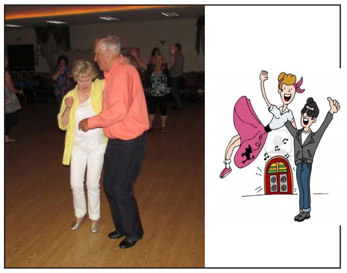
We saw some fancy footwork!