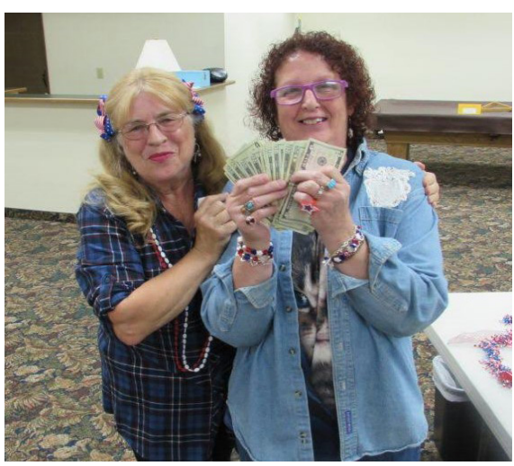
Another happy winner at Bingo Karaoke.