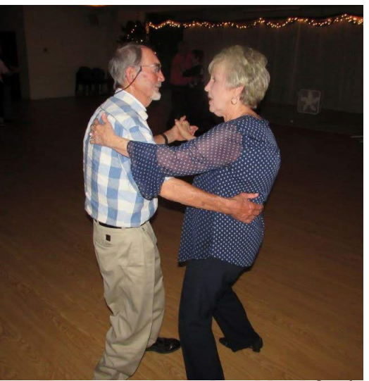
Everyone danced and had fun!