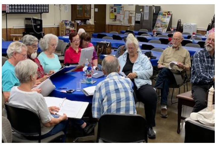
Our Friday Chorus is sounding good.