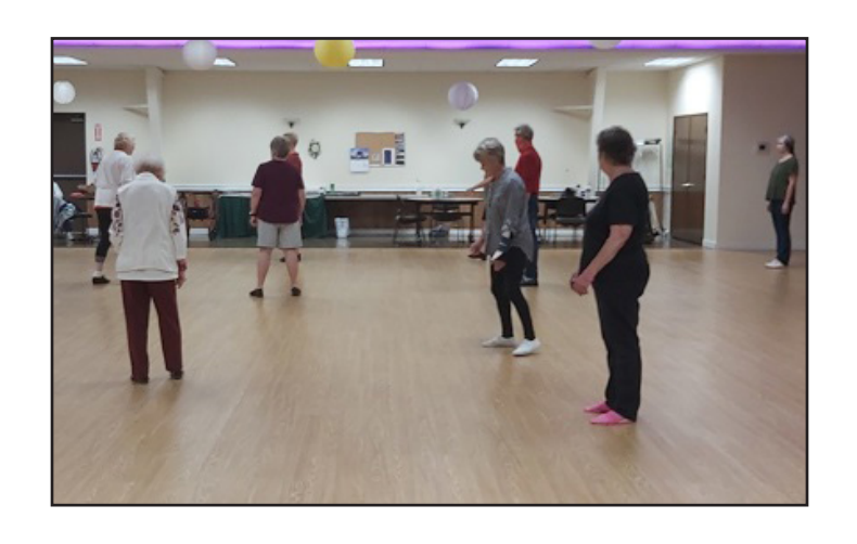
Line Dancers Learning New Steps