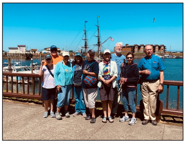
Walkers at Westport