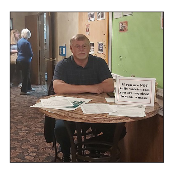
A Huge Thank You To Our Front Door Volunteers