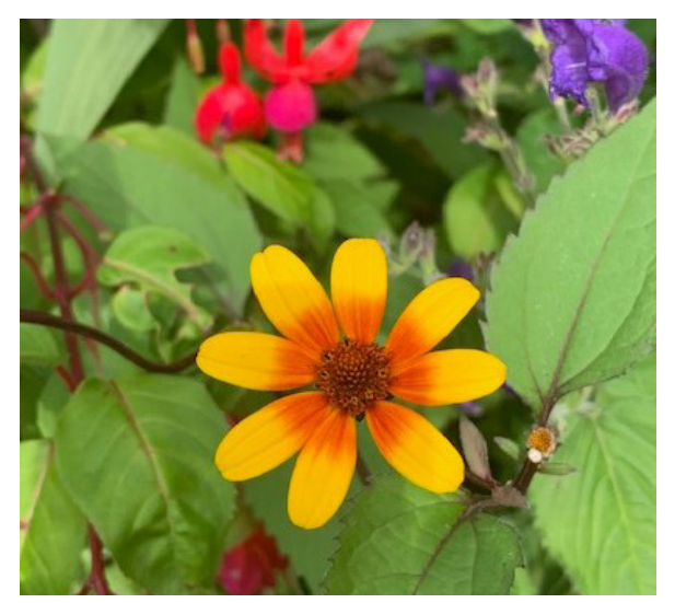
This cheerful flower is a member of the aster family.