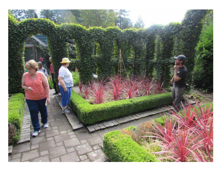
A few of us touring the Potager Garden.