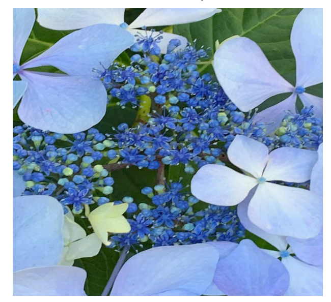
One of the many varieties of hydrangeas in the garden. The soft blue color was lovely.