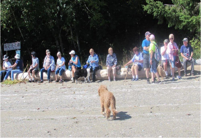
We had a large group of walkers at Fudge Point on August 27th.