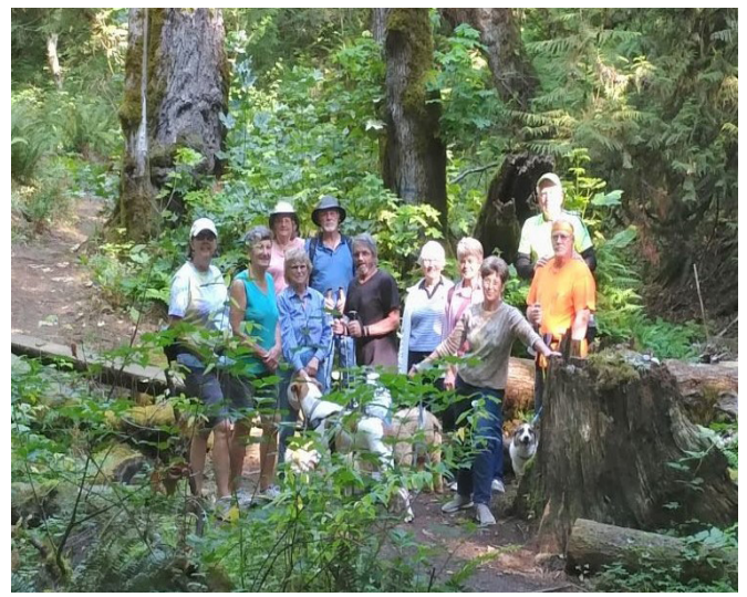
Our walkers on the library trail. The group is always going somewhere beautiful.