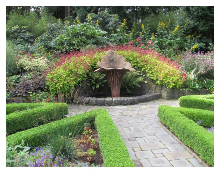
Another view of the Potager Garden with a fountain shaped like a flower.