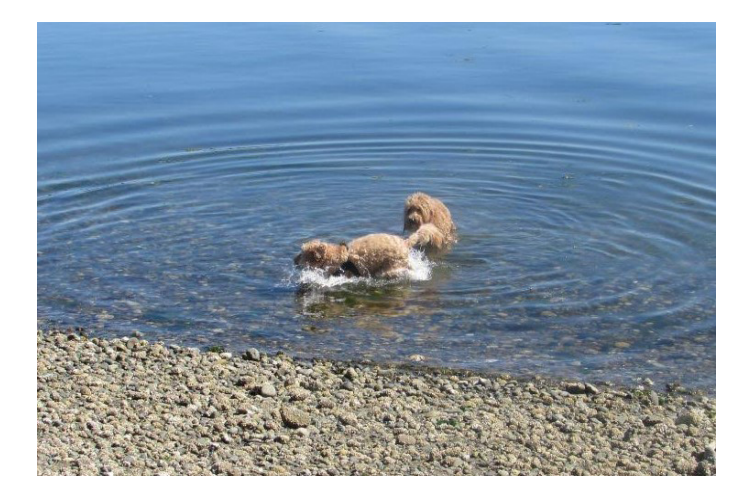
Humans weren't the only ones having fun at Fudge Point!